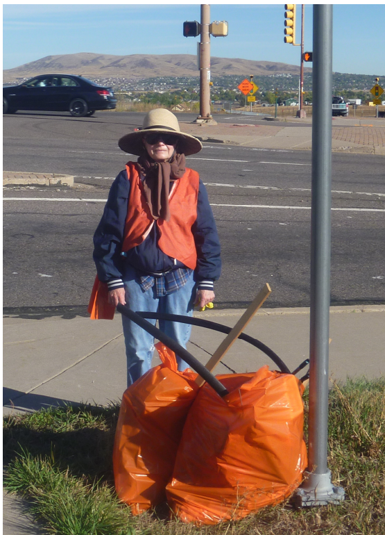
Highway cleanup on October 8