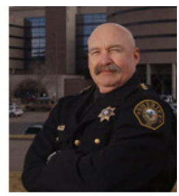
Sheriff Ted Mink

With large fires occurring month of the year, evacuations have become more commonplace. We encourage the adage, 'when in doubt, get out!' If you feel threatened, go! Keep in mind, in some cases, there is no time for formal evacuation notifications due to quickly changing conditions.