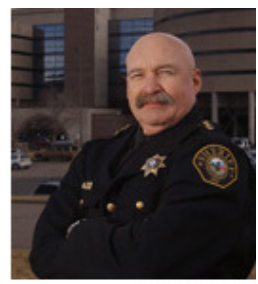
Sheriff Ted Mink

If you park your vehicle in the Open Space lots and/or Park and Ride areas, be responsible about locking your doors. Keep valuables out of sight, preferably locked in the trunk. Better yet, leave valuable items at home. Criminals looking for after-market stereos, purses, wallets and other items like to target cars in these areas, since the cars may be unattended for hours at a time.