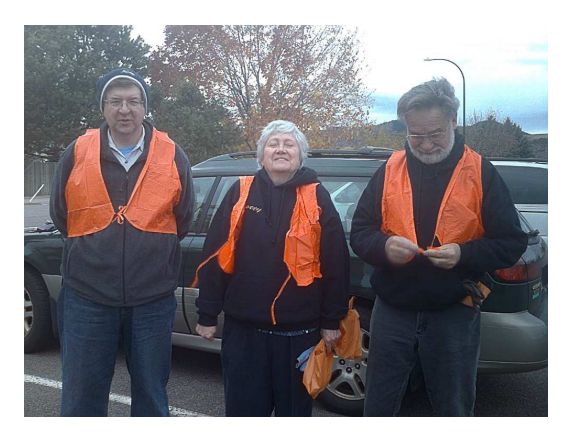
Cohope Clean up-Oct 13

GreenSheenPaint.com 303-514-3955 info@GreenSheenPaint.com the company is located at 5918 S Franklin St, Centennial CO 80121